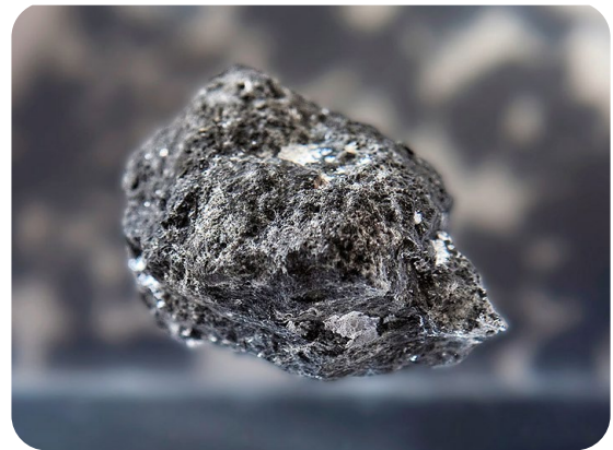
Moon rock from Apollo 14 mission, 1971