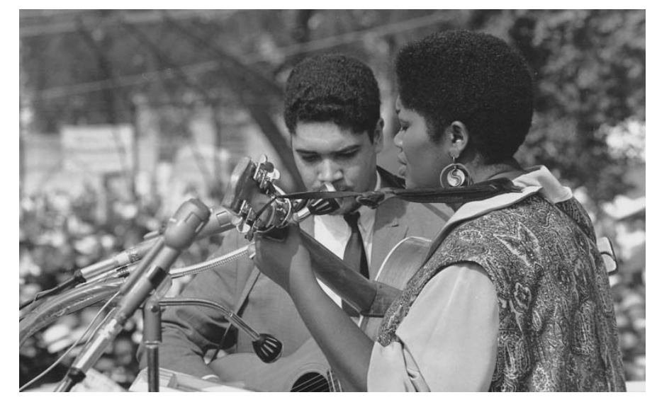
Odetta singing at the 1963 March on Washington

And this video will inspire you and the kids during this activity about changing the world: "Home" (The Jerusalem Youth Choir) https://youtu.be/YJaPUF3IHYg